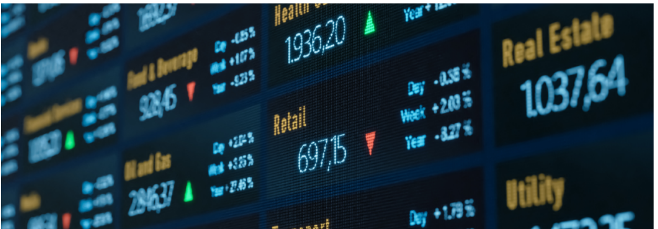
Reforms proposed by the European Commission in markets in financial instruments