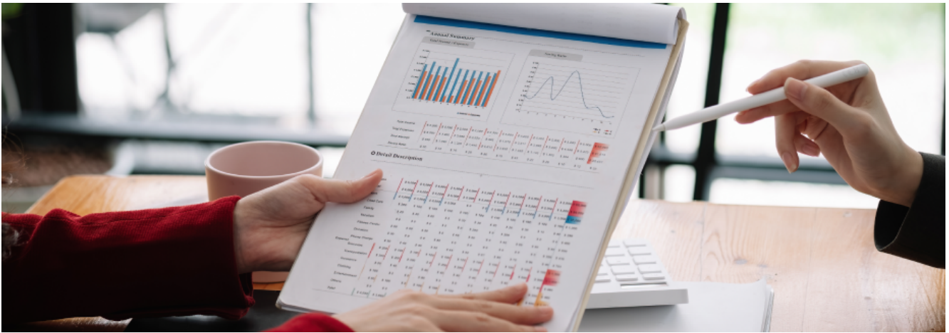
ESMA Final Report on the integrated collection of funds' data