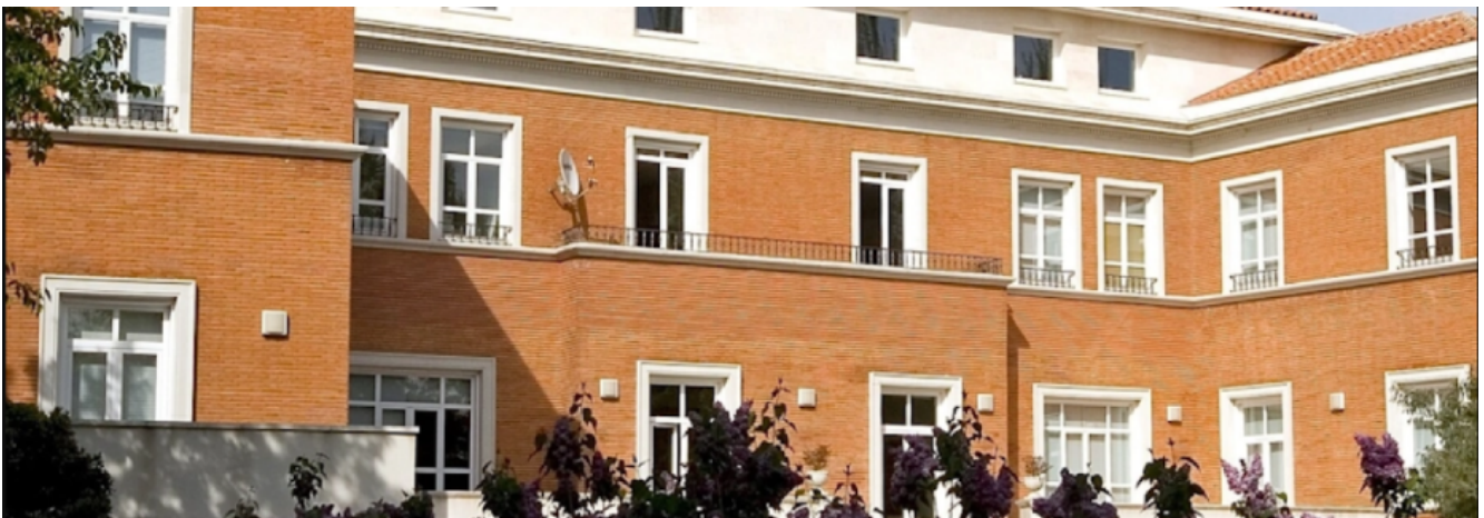
IOSCO 2026 Work Program