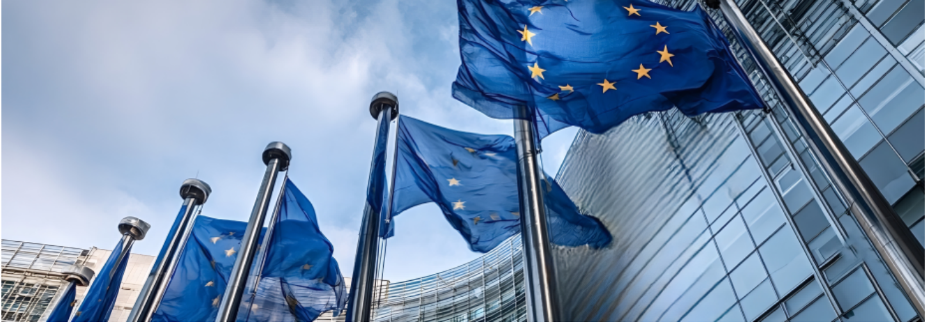
28th regime: The European Commission proposes a new harmonised company form