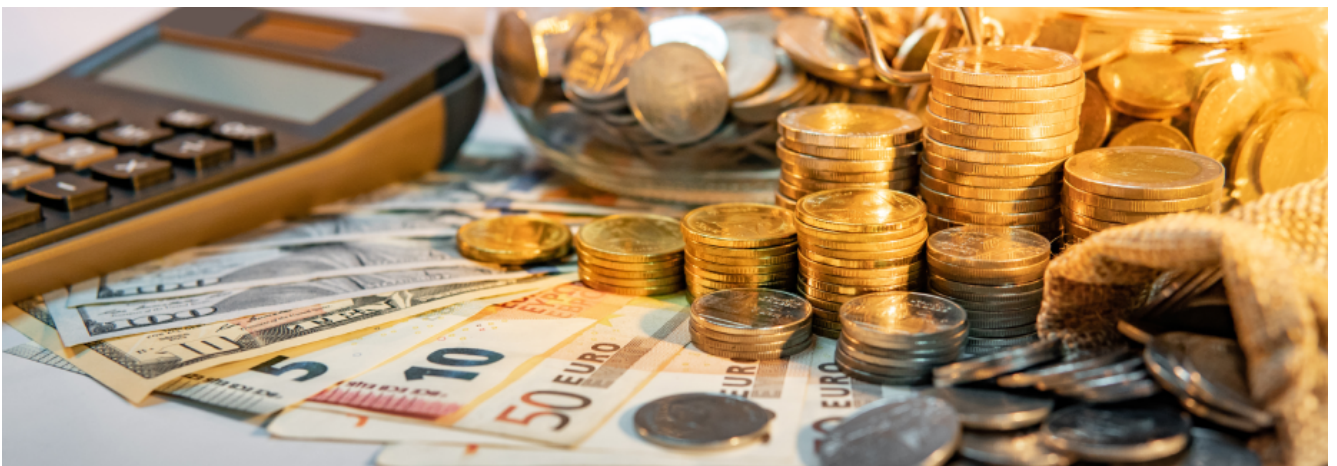
European Commission package on market integration and supervision: key changes to improve cross-border fund distribution in the European Union